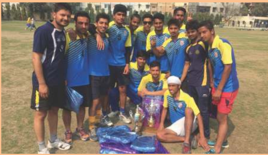
Hockey Team - III in Inter College Championship

he College is known for excellence in sports; and on many occasions, our students have participated in international competitions. The College has a spacious playground for Hockey, Cricket, Football, Kho-Kho, Basket-ball, Tennis, Volley-ball, Swimming, Softball, Archery, Shooting, Baseball, Hand-ball and Wrestling. Adequate facilities for indoor games like Table Tennis, Carrom, Chess and mini Gymnasium are also available.