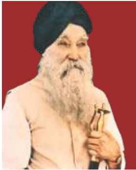
Master Tara Singh Ji

A multipurpose, state-of-the-art Auditorium named after the eminent Sikh leader Master Tara Singh, constructed by Delhi Sikh Gurdwara Management Committee is the hub of academic and cultural activities in University of Delhi. The fully air-conditioned auditorium is equipped with latest facilities. With a capacity of 600, the auditorium has witnessed many cultural and academic activities.