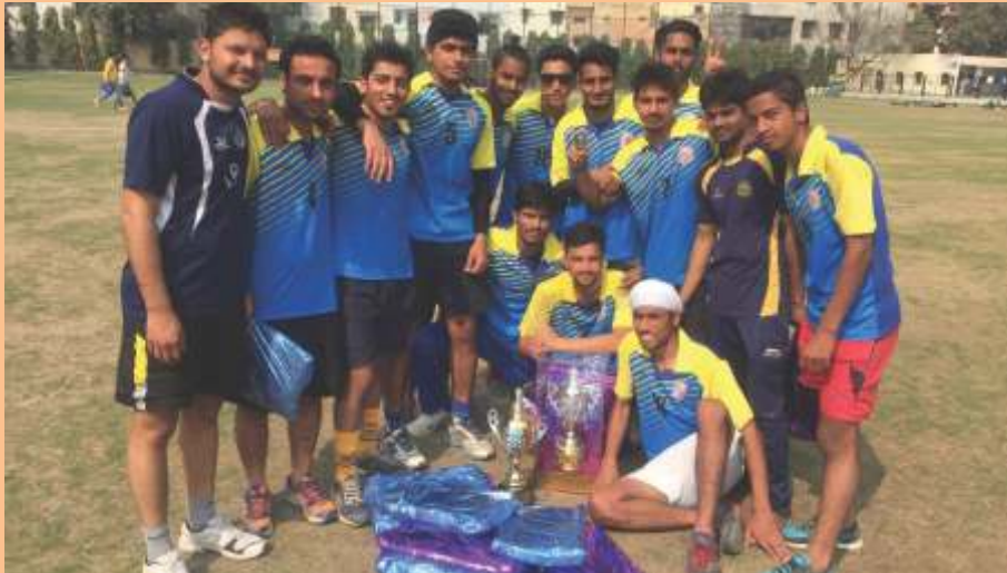
Hockey Team – III in Inter College Championship

The College is known for excellence in sports; and on many occasions, our students have participated in international competitions. The College has a spacious playground for Hockey, Cricket, Football, Kho-Kho, Basket-ball, Tennis, Volley-ball, Swimming, Soft-ball, Archery, Shooting, Baseball, Hand-ball and Wrestling. Adequate facilities for indoor games like Table Tennis, Carrom, Chess and mini Gymnasium are also available.